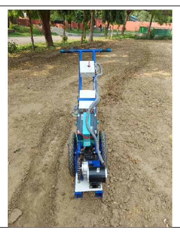
Pusa Mini e-Prime Mover