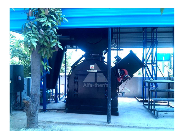
Fig. 1. Incinerator facility at IARI, New Delhi

Different laboratories of IARI generate biological waste that may contain residual hazardous biological agents and their toxic metabolites. To dispose of the biowaste safely, IARI has installed a bioincinerator facility (50 Kg per hour with ash conversion to 1-2 % w/w of initial weight) with an investment of Rs. 18 lakhs in the year 2014. Here, the biological waste generated in the laboratories is incinerated to ash regularly to dispose of them as non-hazardous material (Fig 1). The facility operates on a regular interval to dispose of the materials safely. The records related to the incinerated material are documented and preserved (Refer to the attachment). Other wastes like chemicals are subjected to chemical treatments to make them non-hazardous to the environment.