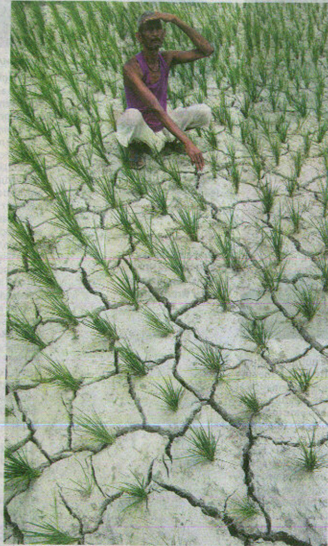
RITU RAJ KONWAR

While the insured sum here looks sufficient to cover the cost of production, it is way less than a farmer's income in a normal season. In MNAIS, the Centre capped the maximum premium that can be paid for a crop. So, in crops where actuarial rates were higher, insurers reduced the