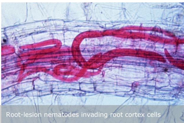
Root-lesion nematodes invading root cortex cells